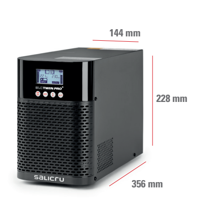
SLC 700/1000 TWIN PRO2 (IEC)