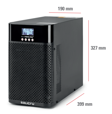
SLC 1500÷3000 TWIN PRO2 (IEC)