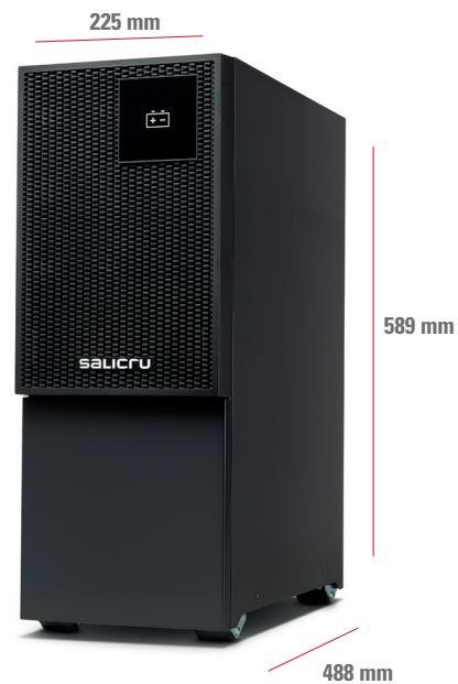
EBM - SLC TWIN PRO3