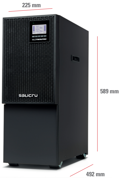
SLC 4000÷10000 TWIN PRO3